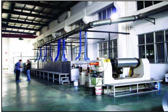
Degreasing and pretreatment Line