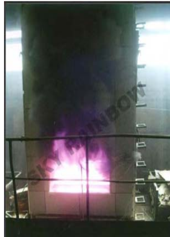
Fire-proof B1 (DIN4102)