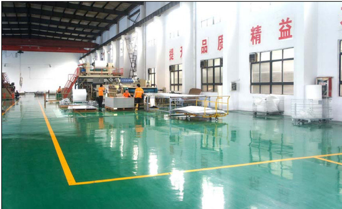
2000mm Wide Composite Line