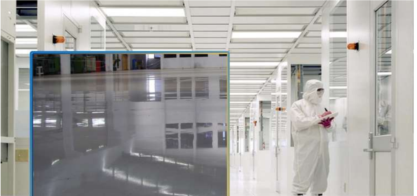
Clean room epoxy floor