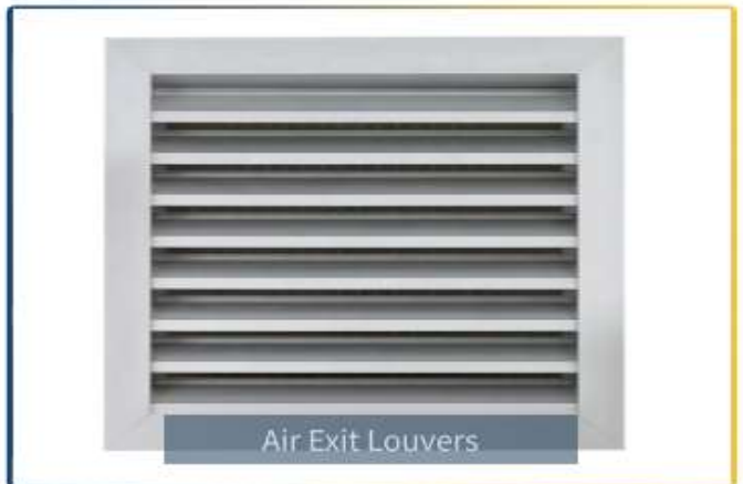
Air Exit Louvers