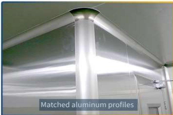
Matched aluminum profiles